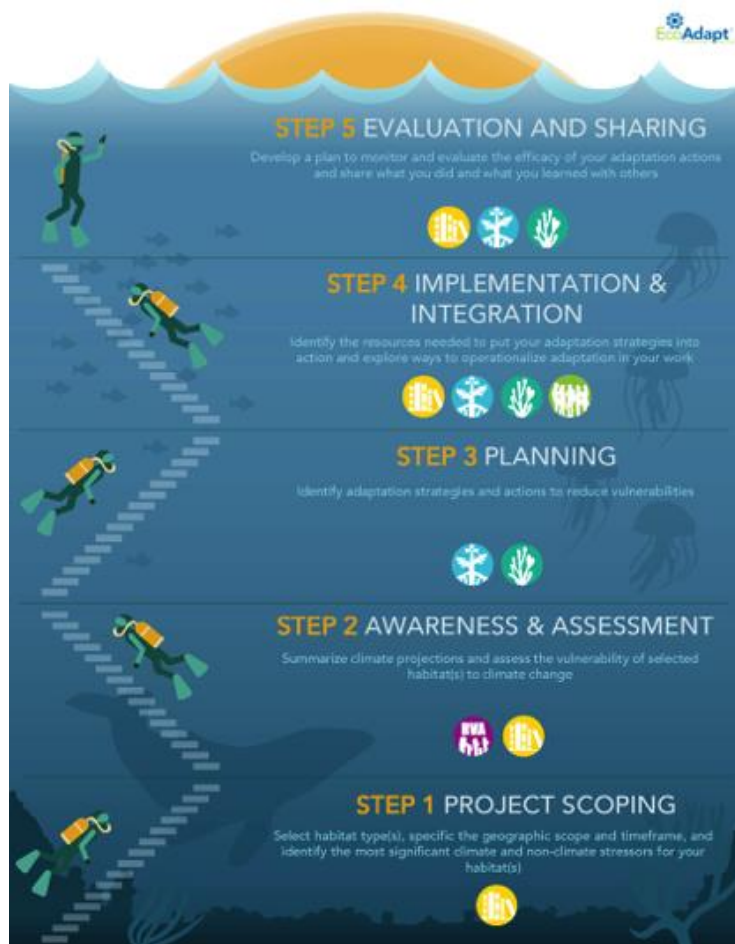
Figure 1. Scuba-map describing the steps of the training module.

The intended users of this training module are managers of marine and coastal protected areas that want to ensure their management practices are informed by the far-reaching impacts of climate change. In most cases, multiple staff from a site will need to be familiar with the Climate Adaptation Toolkit to ensure successful implementation of adaptation planning. More broadly, restoration and conservation practitioners beyond protected areas management will find the resources highlighted here useful in their work.